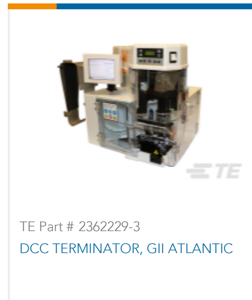
TE Part # 2362229-3 DCC TERMINATOR, GII ATLANTIC