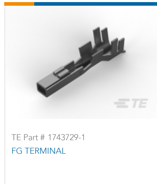
TE Part # 1743729-1 FG TERMINAL