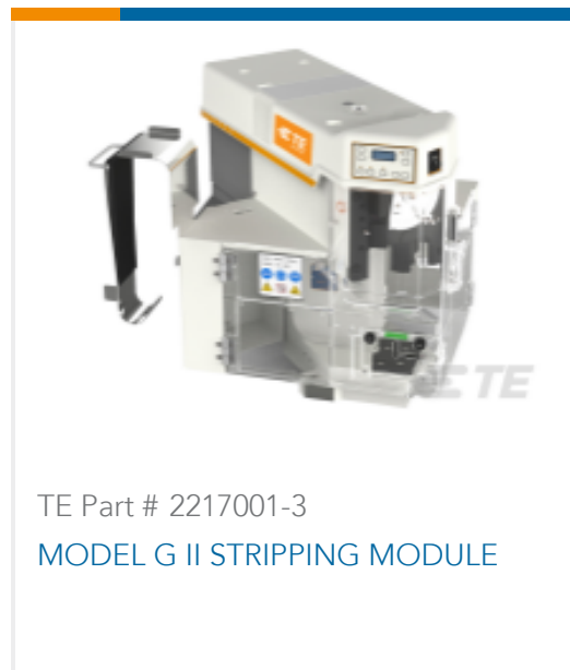
TE Part # 2217001-3 MODEL G II STRIPPING MODULE