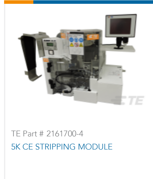
TE Part # 2161700-4 5K CE STRIPPING MODULE