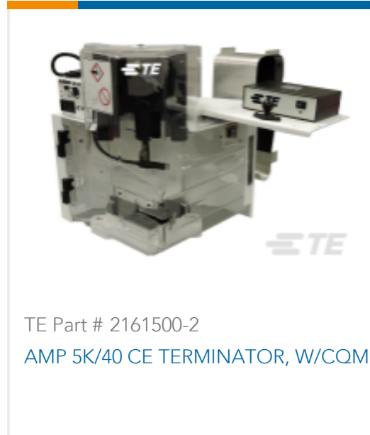
TE Part # 2161500-2 AMP 5K/40 CE TERMINATOR, W/CQM