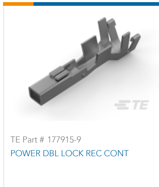
TE Part # 177915-9 POWER DBL LOCK REC CONT