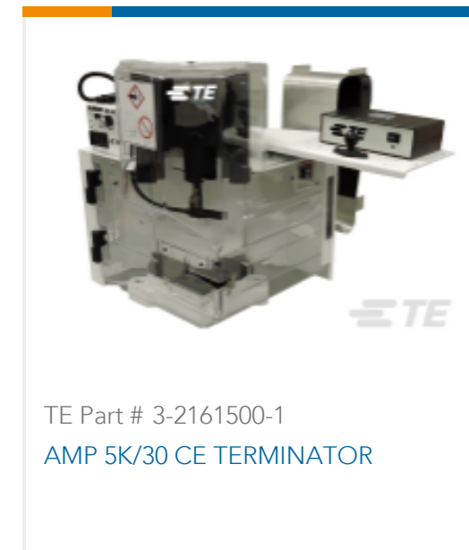
TE Part # 3-2161500-1 AMP 5K/30 CE TERMINATOR