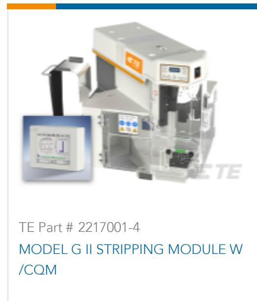
TE Part # 2217001-4 MODEL G II STRIPPING MODULE W /CQM