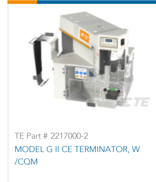
TE Part # 2217000-2 MODEL G II CE TERMINATOR, W /CQM