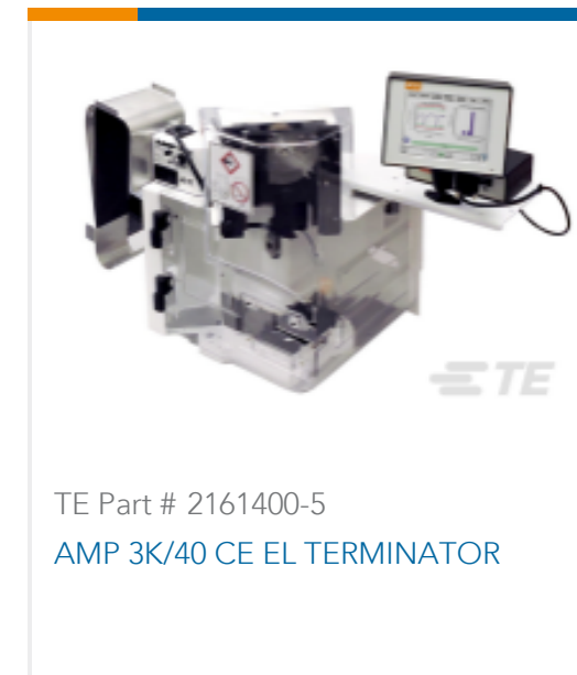
TE Part # 2161400-5 AMP 3K/40 CE EL TERMINATOR