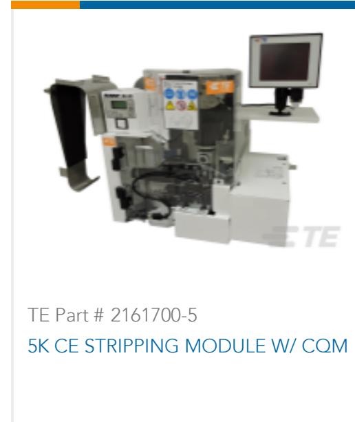
TE Part # 2161700-5 5K CE STRIPPING MODULE W/ CQM